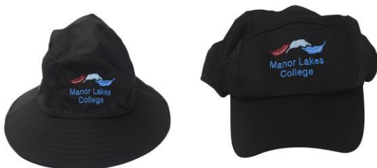
Legionnaires Hat (black with Logo) $15.95 Bucket Hat (With Logo) $16.95