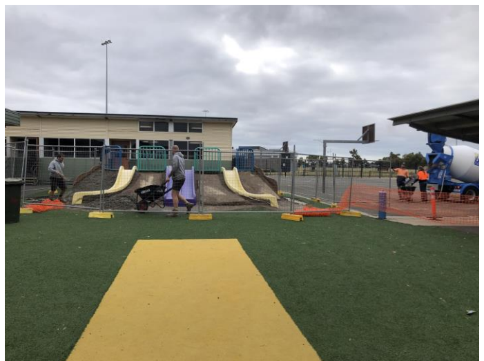
Work taking place on Garnpung Playground.